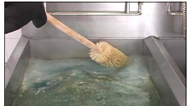
Scrub stubborn stains with a brush as the cleaning solution simmers in the frypot.