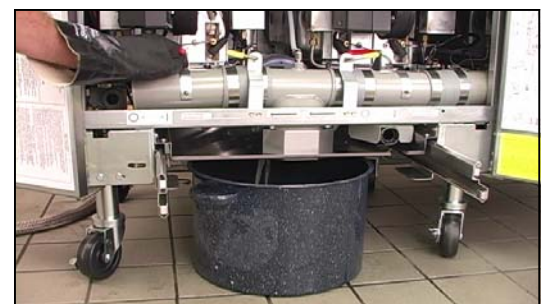
Drain slowly into a metal stockpot. Do not drain into the filter system or an SDU.