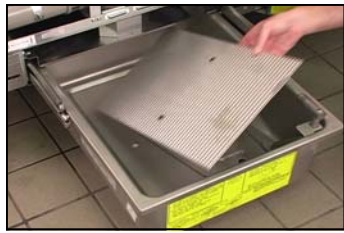
Place the inner screen in first (above) and then the