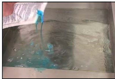
Add cleaning solution to water in the frypot.